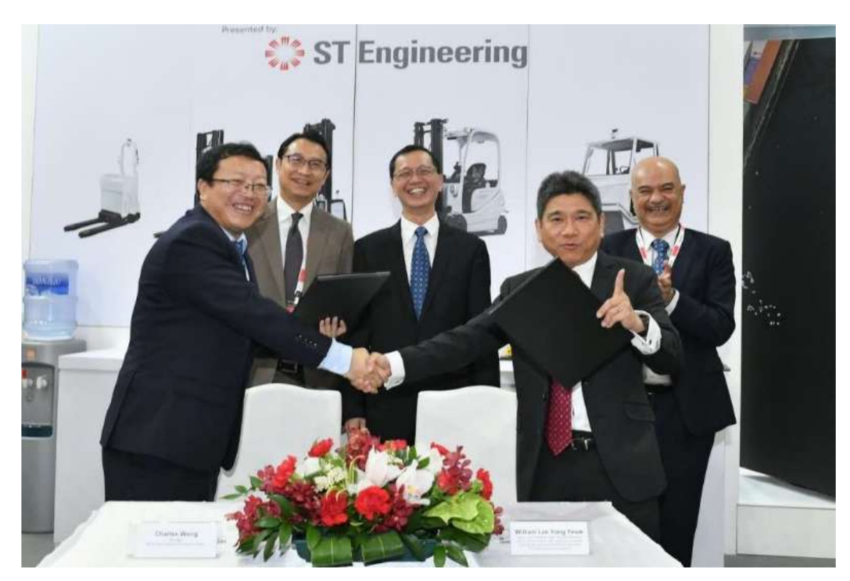
BYD and ST Engineering signing a cooperation agreement at the Singapore Industrial Fair